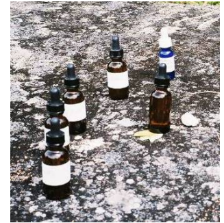
The spirit connection between Machu Picchu in the Andes and Mt Kailash in the Himalayas is captured in this essence.

Be willing to name what you know. There is power in naming - call it what it is.